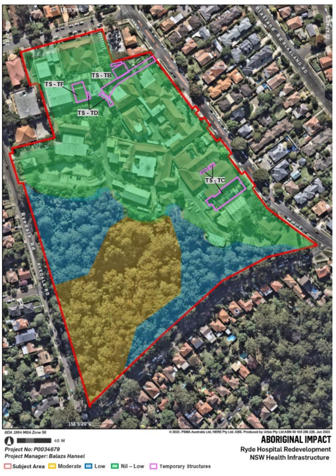
Figure 2 – Proposed impacts to Aboriginal archaeological potential